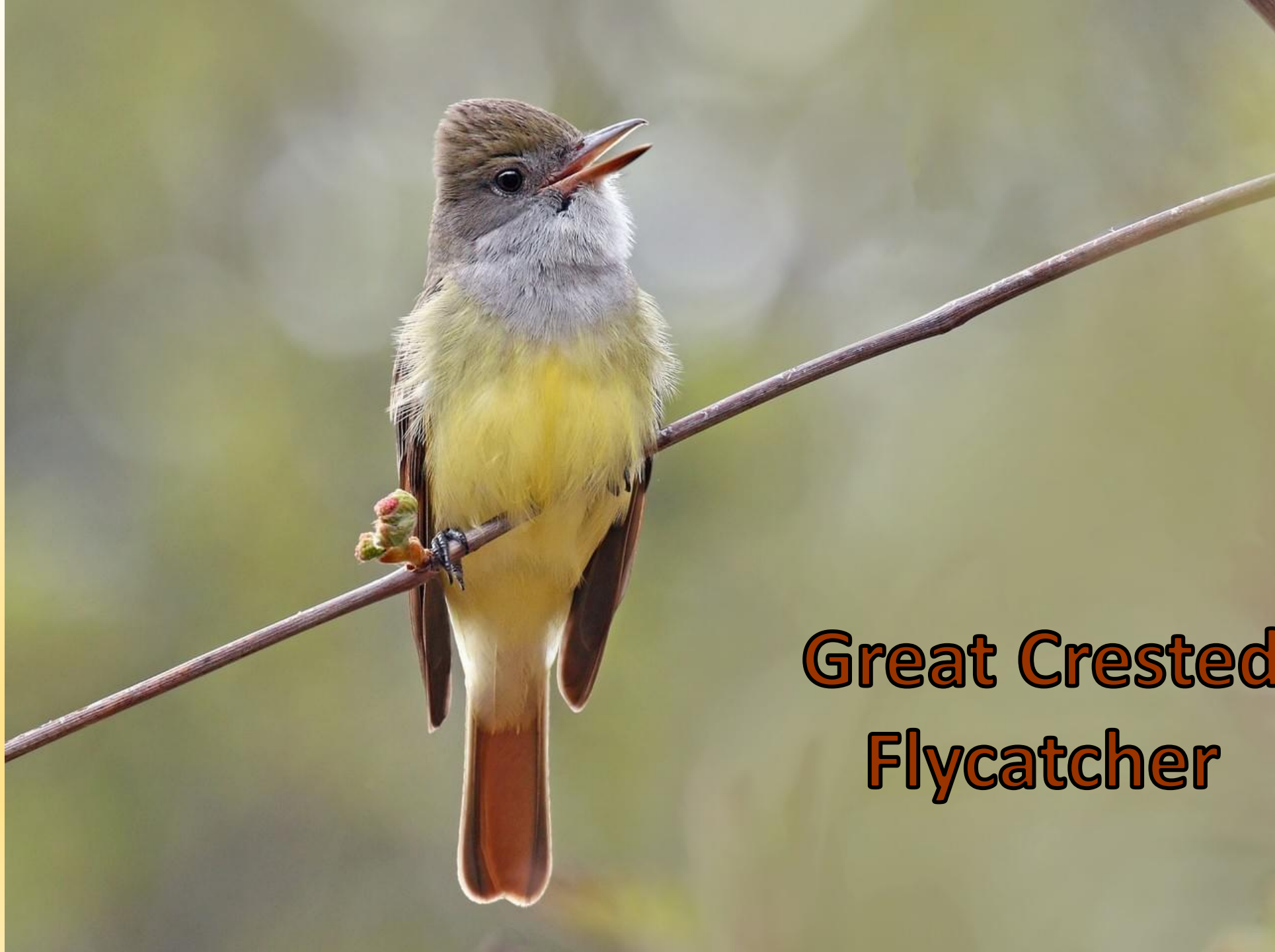
Great Crested Flycatcher